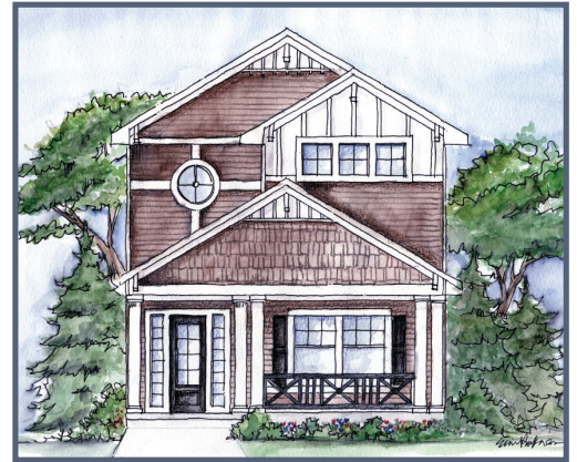
Plans and drawings are preliminary and are subject to change without notice. Artist rendering is for conceptual purposes only and may not be relied upon.